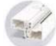
Meeting rails with Integral sash interlock.

Beauty, Comfort, Value enjoy living in greater beauty and comfort, and increase your home's value today.