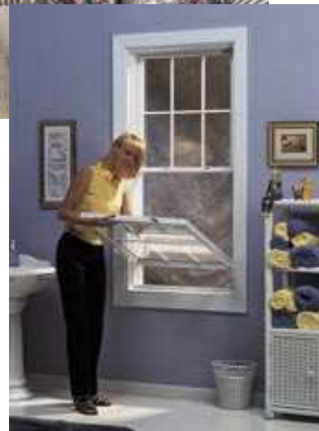
Our fusion welded double-hung windows offer beauty, maintenance freedom, and peace of mind at a price you can live with.