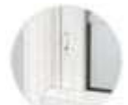
Ventilation limit latch and tilt-latch.