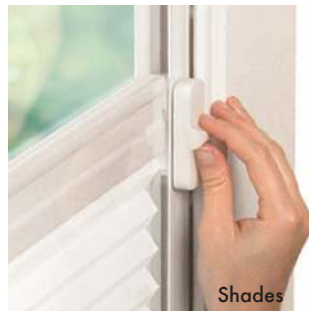
Top or bottom control