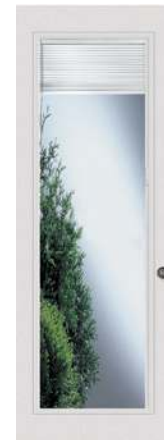
Full 8'0" Door 612/496-RLB