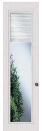
Full 8'0" Door 487-RLB