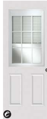
Half Door 684-CGBG-BLD 9-light