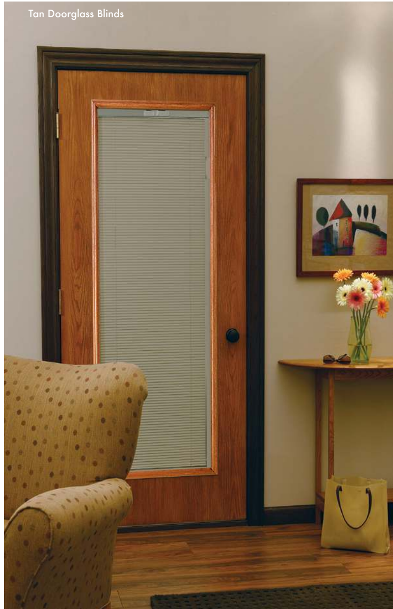
Tan Doorglass Blinds