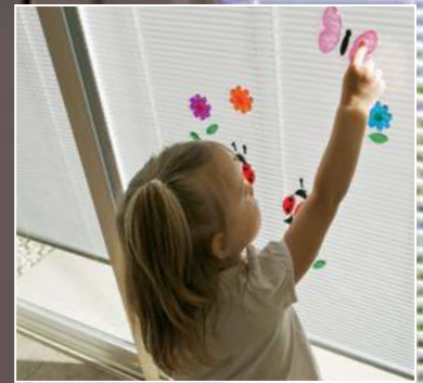
Sliding Patio Doorglass Blinds