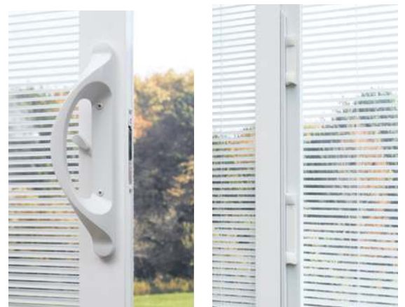
Light-Touch® controls easily raise and lower the blinds. Tilt control allows for precise adjustments of the blinds.