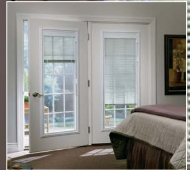
Triple Glazed Doorglass Blinds