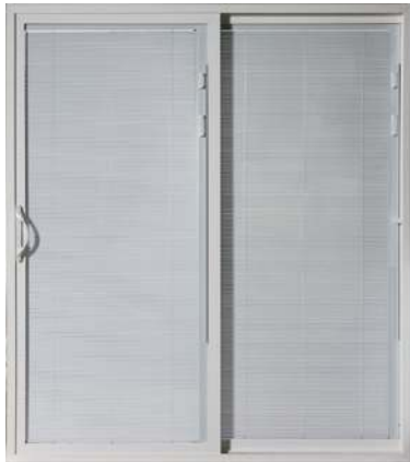
Sliding Patio Door with Blinds between Glass right-sided slide NEW 300829 white or desert sand