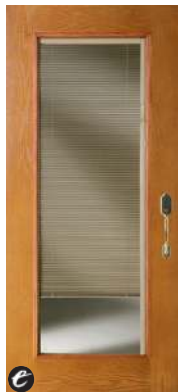
Full Door 686/687-RLB Tan