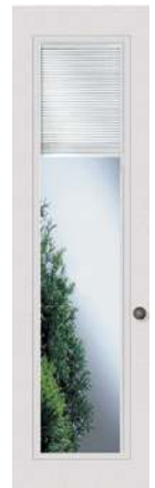
Full 8'0" Door 487-RLB

Indicates available in Low-E glass (models 684, 686, 687, 690).