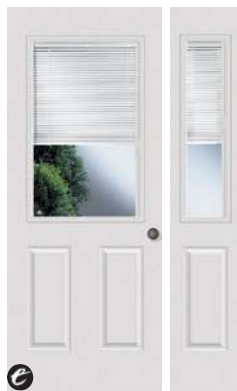
Half Door 684/672-RLB* Half Sidelight 692-RLB