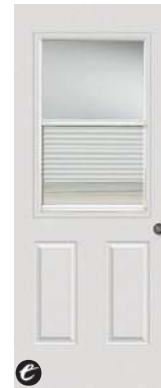
Half Doorlight 684/672-RLS