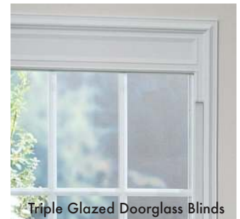
Slats disappear behind valance