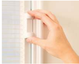
Light-Touch® control raises and lowers the blind with 4 pounds of force on the 64" size.

*Models 684, 672, 686, 687 have separate controls for the tilt and raise/lower functions.