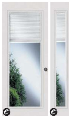
Full Door 686/687-RLB* Full Sidelight 690-RLB