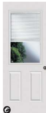
Half Door 684-RLB

* STC = Sound transmission coefficient. See odl.com for more information.