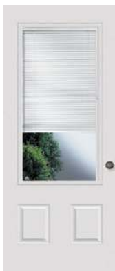
3/4 Door 607-RLB