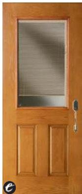
Half Door 684-RLB Tan