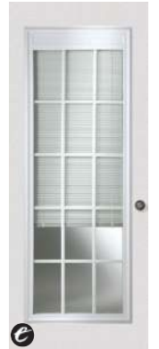
Full Door 686-CGBG-BLD 15-light