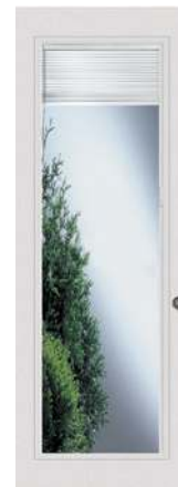
Full 8'0" Door 612/496-RLB