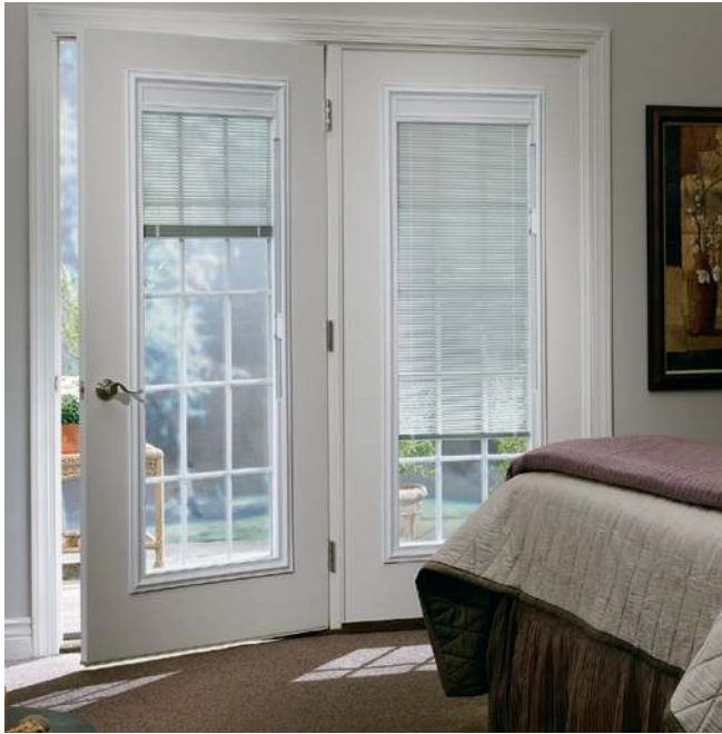
Slats disappear behind valance when fully raised.