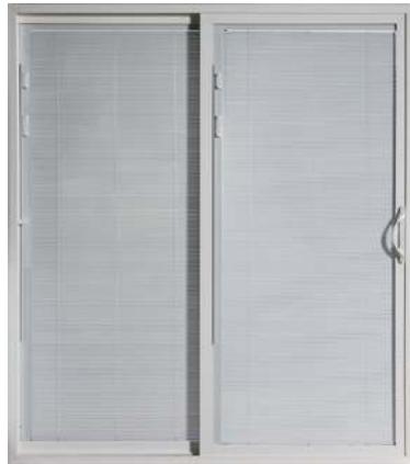
Sliding Patio Door with Blinds between Glass left-sided slide NEW 300830 white or desert sand

The all-in-one ODL Sliding Patio Doors with Blinds Between Glass offers a new level of control, convenience and durability in a sliding glass door.