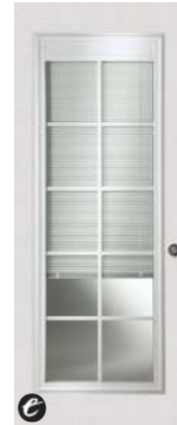
Full Door 686-CGBG-BLD 10-light