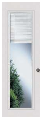
Full Door 624-RLB