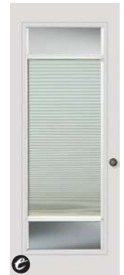
Full Doorlight 686/687-RLS