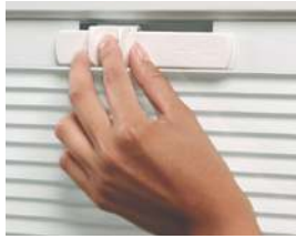
Fingertip tilt control