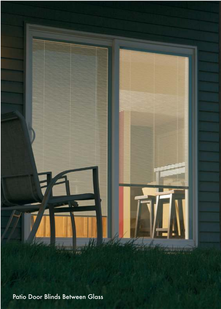
Patio Door Blinds Between Glass